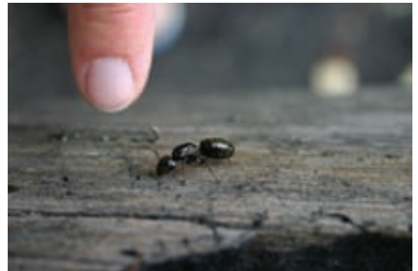
Carpenter ants are large, black or reddish-black ants which nest in moist or decayed wood.

Usually, the first sign of a problem is when a homeowner notices sawdust-like material on furniture below a solid wooden beam in a house. Carpenter ants are nocturnal and the sawdust will seem to reappear each morning with no apparent reason. Homeowners may also see the ants trailing at night along a wooden beam. If you notice this sawdust like material or ants, give us a call and we will eradicate your carpenter ant problem. ■