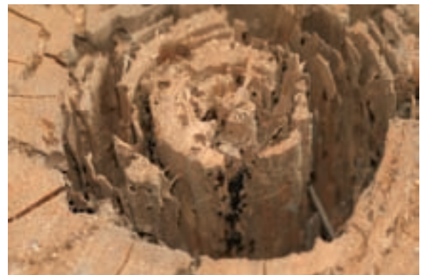
Carpenter ant galleries in wood.